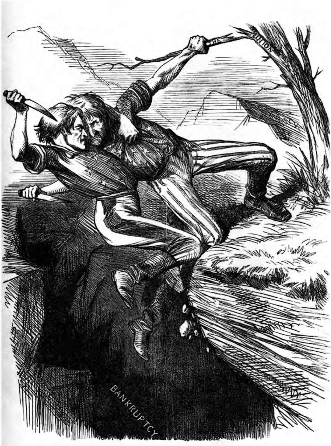
A cartoon from an English magazine, June 1862. The two figures represent the North and the South.