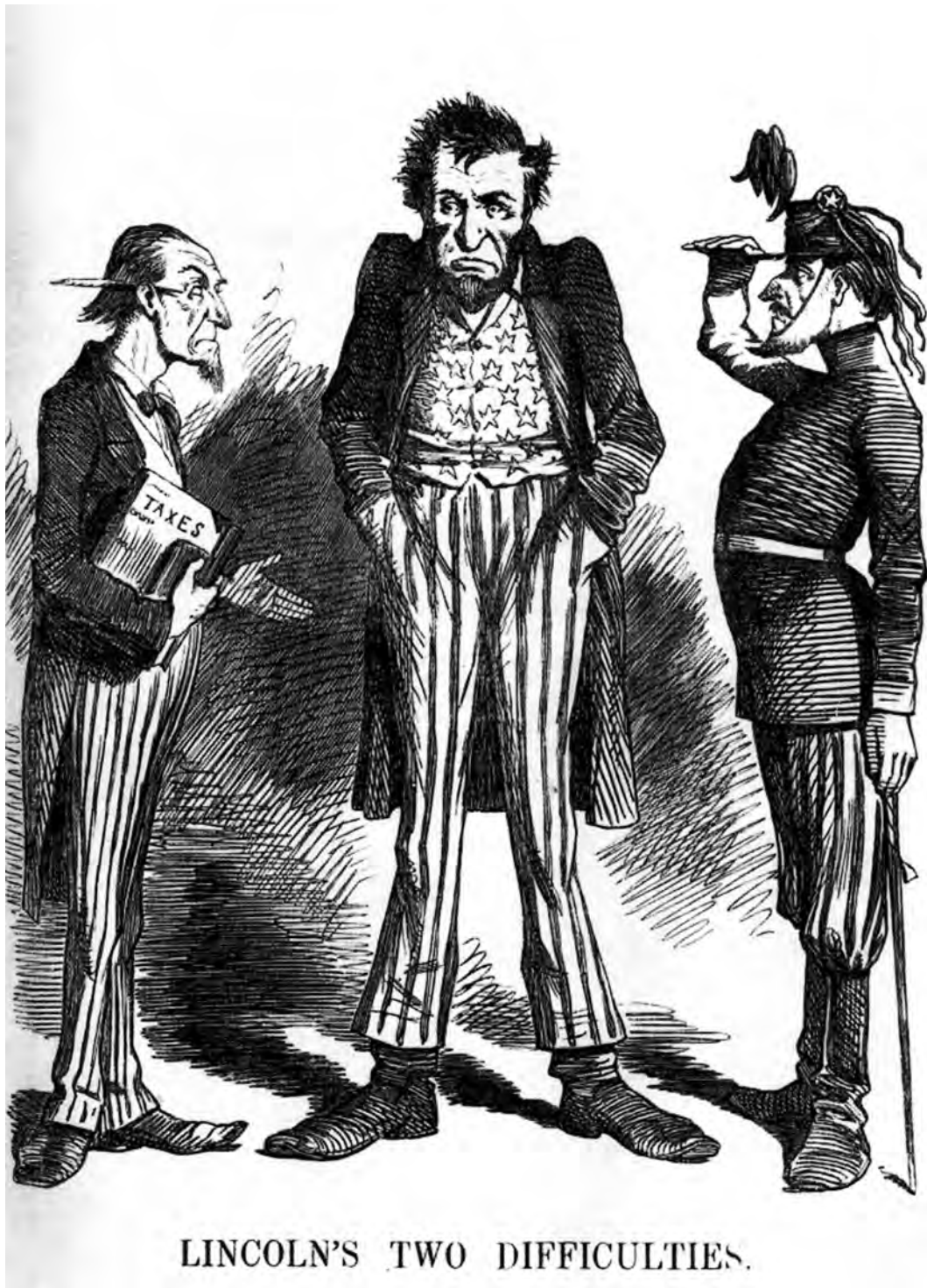
A cartoon from an English magazine, August 1862.